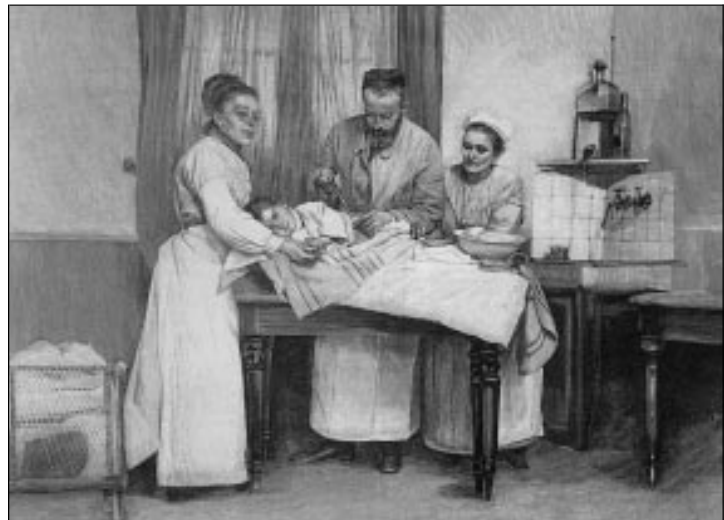
Serum treatment for diphtheria, 1894

Internationally, randomisation was mentioned by van Helmont in 1662. 18 He suggested the casting of lots to decide which patients with fever should be assigned to blood letting and which should not. Randomisation was not used in clinical experiments, however, before 1898. 19 In 1884 Peirce used a deck of cards to determine the order of weight changes in an investigation of the threshold for perception for small differences in weights. 20 Peirce's innovation was not appreciated, and he is mostly remembered as one of the founders of the philosophical movement called pragmatism. Some months later, the French Nobel laureate Richet published a series of trials that investigated whether thoughts could be transferred from one subject to another. 21 After a person had drawn a card from a deck