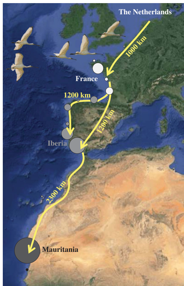
Figure 1. Map of spoonbill migration system. The sizes of the dots represent the number of individuals in the analysis that wintered at each site. (Online version in colour.)

mortality rates. This paucity of studies is easily explained by the difficulty of following individual birds throughout their annual cycle. Although some studies compared annual survival of individuals or populations with varying migration distances [11,12], estimating annual survival is not appropriate for measuring the cost of migration; the mortality cost of migration may be outweighed by the survival benefits of wintering further away from the breeding grounds [13]. For a proper assessment of the mortality cost of migration, we need to compare mortality during migratory and stationary periods of individuals with varying migration distances, while keeping constant as many other variables as possible.