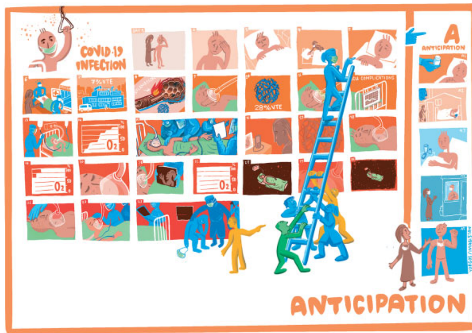
Fig. 3 Illustration of the PDA strategy: anticipation—medical treatment in patients with COVID-19 is essential for improved clinical outcome. Early identification of patients at risk of disease worsening and application of the recommended treatments at the level of the primary health care structures are related with improved clinical outcome and decreased mortality. The first 5 to 7 days after SARS-CoV-2 infection is a critical period for that requires identification of patients at risk of disease worsening and personalized therapeutic strategy . PDA, prevention, detection, and anticipation; VTE, venous thromboembolism.

recommendations of the relevant consensus statements and scientific societies. It is important to renew all of these prescriptions for avoiding any rupture and omission in these vulnerable patients.