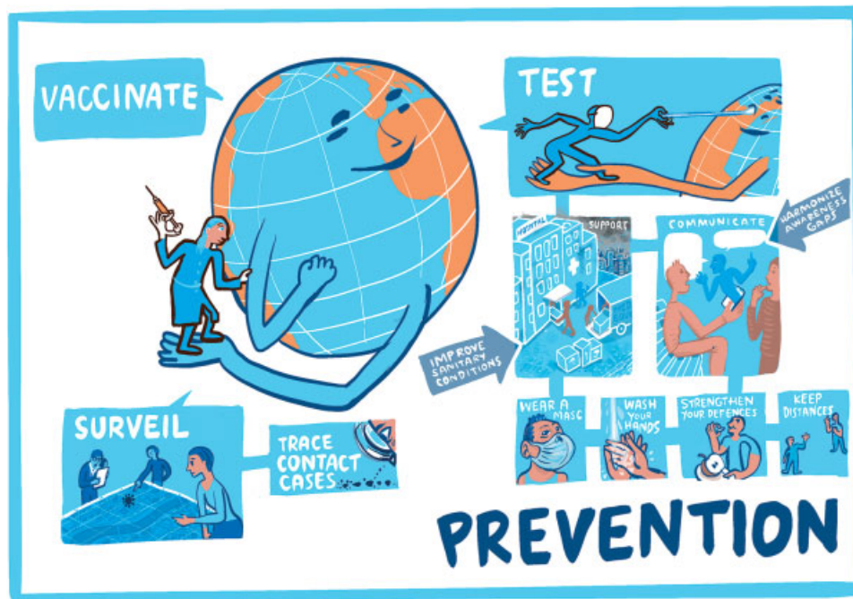
Fig. 1 Illustration of the PDA strategy: prevention of SARS-CoV-2 infection accelerated massive vaccination world-wide, epidemiological surveillance, masks, distancing, improvement of sanitary conditions, and setup of primary health care structures, which are capital elements for the mitigation and the control of the pandemic. PDA, prevention, detection, and anticipation.

understanding the epidemiology of the pandemic and its management. Pharmaceutical companies and consortiums having a pivotal role in the development of vaccines, diagnostic tests, and treatments for COVID-19 need to cooperate and diffuse technological knowhow for massive production of the tools required for the control of the pandemic. According to the WHO and the World Trade Organization, there is an urgent need for “ global solidarity and unhindered global sharing of technology and know-how. ” 103,104 The recent recommendations of the Council for Trade-Related Aspects of Intellectual Property Rights of the World Trade Organization should be taken into consideration, 105 without blind limitations of the Trade Related Aspects of the Intellectual Property Rights Agreement especially in the light of a devastating pandemic. Unconditioned technology transfers should be eased so that the production and supply of COVID-19 medical goods, including vaccines and tests, will be boosted and more global access to them will be available. In the same line, the elaboration of an enlarged industrial action plan coordinated by the WHO is required for the development and production of the second-generation vaccines, free of patent restrictions.