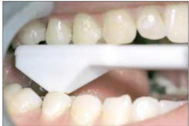
Figure 1b: Using the Tooth Slooth to identify damaged cusps.