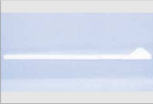
Figure 1a: The Tooth Slooth. The concave surface of the head is placed against the suspect cusp.