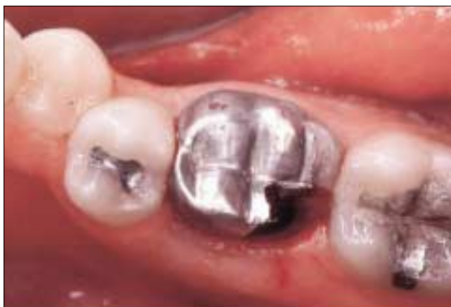
Figure 7: Fracture of the disto-lingual cusp of an extensively restored mandibular right first molar.