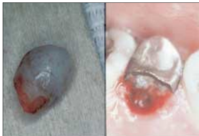
Figure 8: Fracture of the palatal cusp of an extensively restored maxillary right second premolar. The fractures in Figs. 4, 5, 7 and 8 could have been prevented by incorporating appropriate cuspal reinforcement in each restoration.

in such unrestored teeth, with subsequent involvement of the underlying tooth. 2,14 There are reports in the recent literature of the generation of such cracks associated with lingual barbells. 22 A classification of the etiological factors of CTS is presented in Table 1 .