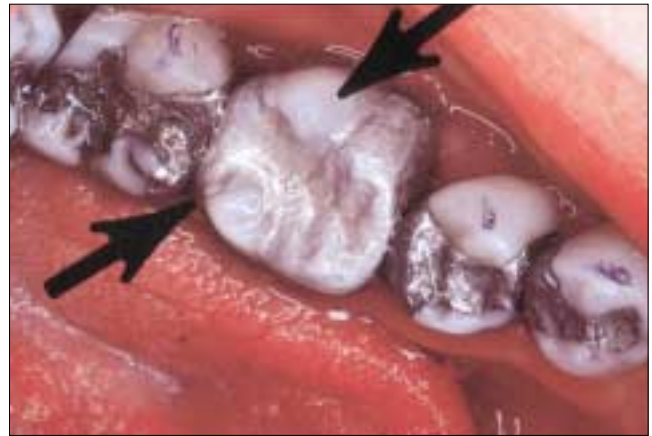
Figure 3: An extensively restored mandibular left first molar. The tooth has been weakened by the placement of an extensive intracoronal restoration. The arrows indicate the areas most prone to future crack formation.

principle of the so-called “bite tests” where the patient is instructed to bite on various items such as a toothpick, cotton roll, burlew wheel, wooden stick, 2,13,14 or the commercially available Tooth Slooth (Professional Results, Inc., Laguna Niguel, Calif.) (Fig. 1a). 2 Pain increases as the occlusal force increases, and relief occurs once the pressure is withdrawn (though some patients may complain of symptoms after the force on the tooth has been released). 2,3,11 The results of these “bite tests” are conclusive in forming a diagnosis (Fig. 1b).