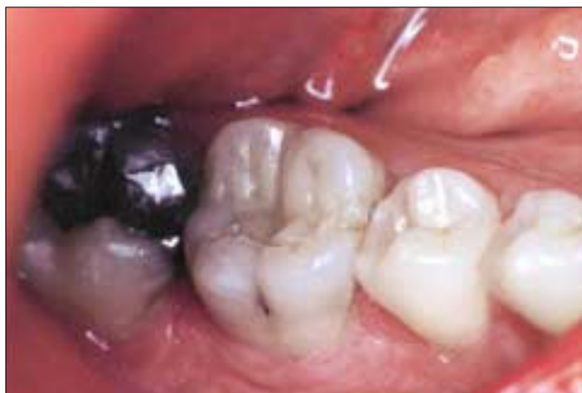
Figure 4: Fracture of a mandibular right first molar. This tooth was weakened by the placement of an extensive intracoronal restoration.