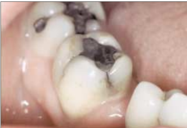
Figure 2: Stained crack lines on the mesial and buccal surfaces of a mandibular molar. If this tooth is asymptomatic, no treatment is required and the tooth should be monitored closely.