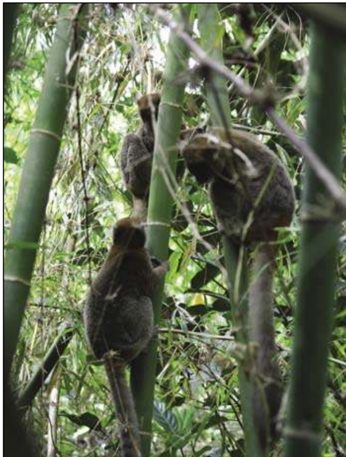
Figure 5. Prolemur simus eating bamboo in July 2007 at Mahasoa.