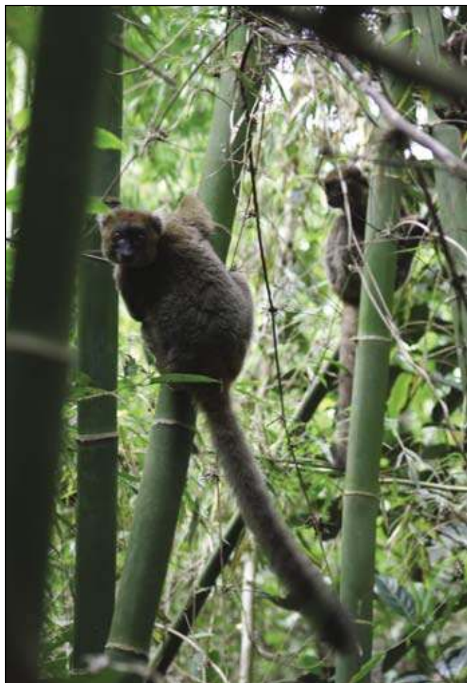
Figure 4. Prolemur simus photographed in July, 2007 at Mahasoa.

One reason why P. simus is critically endangered may be its monotonous diet. Primates with a specialized diet often are at risk (Jernvall and Wright 1998; Wright and Jernvall 1999). In a long-term study of three species of bamboo lemur at Ranomafana, Tan (1999, 2000) found that the diet of greater bamboo lemurs is almost exclusively bamboo, and in fact 95% of the diet is just one species of bamboo ( Catharios-tachys madagascariensis ), with 3% being provided by other bamboo and grass species, 0.5% by fruit, and 1.5% other foods (including soil and fungi). This feeding strategy varies with