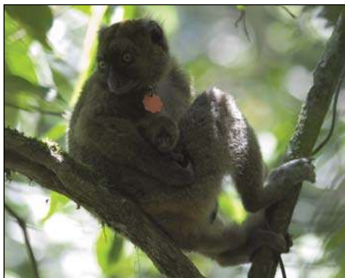
Figure 2. Prolemur simus mother and infant born December 18, 2007 at Talatakely, Ranomafana.

one subadult natal male, one subadult natal female and the 9-month-old infant.