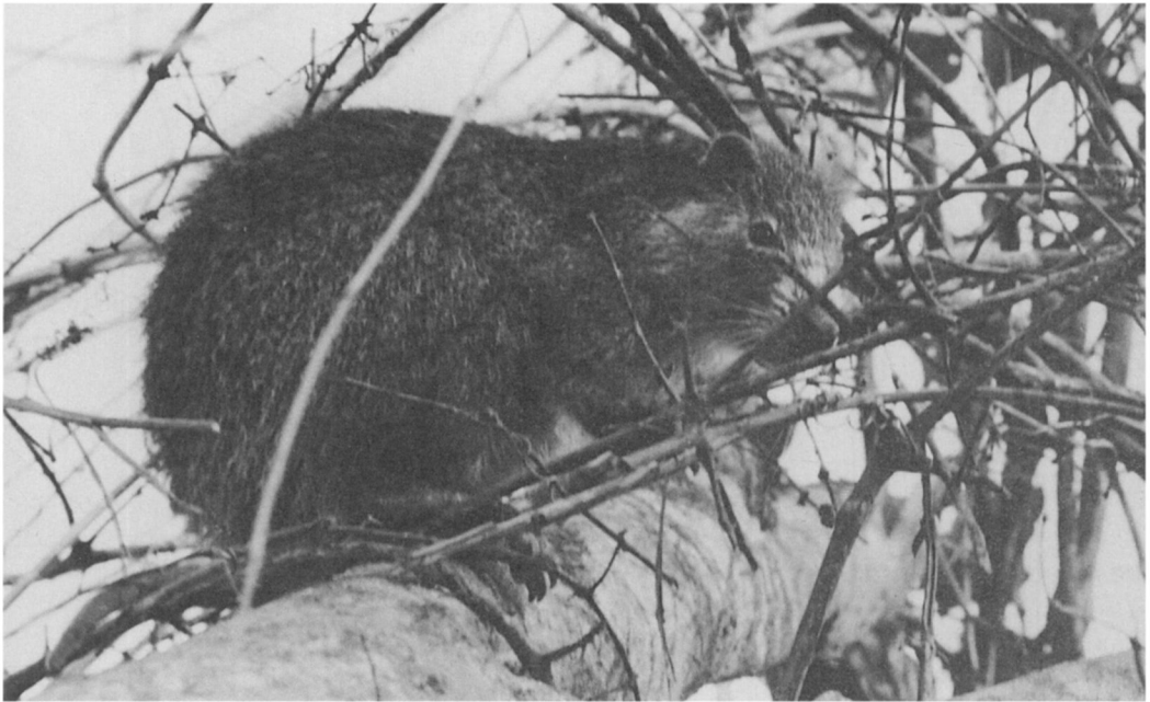
Capromys pilorides , the most abundant species of hutia in Cuba (V. Berovides Alvarez).

other species. As a minimum the following measures are urgently needed: