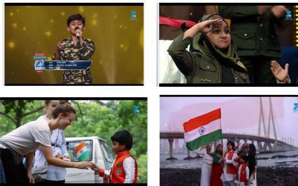
Image2: Glimpse of "Sa Re Ga Ma Pa" Indian Reality TV Show

and reproduced, so the national context of reality television can also be considered as identity performances. Through the cameras, the contestant's performances, their feelings, their thoughts about the challenges, and reactions of parents, and judges used to convey 'reality' to its viewers. We can identify the representation of India as a 'family' through the participation of the contestants from the state namely; Andhra Pradesh, Delhi, Karnataka, Maharashtra, Madhya Pradesh, Odisha, Punjab, Rajasthan, and West Bengal. Cities like Darjeeling, Kolkata, Amritsar, Vishakhapatnam, Mumbai, Bhubaneswar, Faridkot, Bhatinda, Gwalior, Ludhiana, Barmer, etc. The covered location of different states and their cultural expressions through glimpse tries to connect the viewers with national context throughout the whole seasons of the Sa Re Ga Ma Pa show.