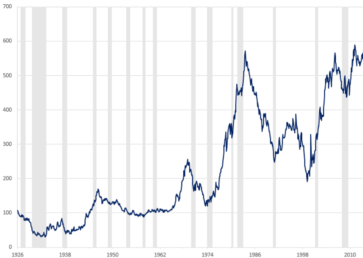
Figure 1 US small-cap premium. January 1926 (=100)–December 2013. Shaded areas indicate recessionary periods.

This paper provides a new approach to assessing the time-varying nature of the small-cap premium for Canada and the US, by testing the hypothesis that the link between macroeconomic and financial variables that drives this premium (or discount) is dependent on the business cycle. The hypothesis is motivated by the empirical regularity that small-cap firms outperform (underperform) large-cap firms during periods of economic expansion (contraction). Only a few studies have looked at this issue to date (e.g., Chan et al., 1985; Switzer, 2010, 2013). Figure 1 provides a graphical illustration of this phenomenon for the US experience since 1926. Comparable data are available for Canada since 1970 and are projected on Figure 2. In both cases, a downward trend in the small-cap premium can be seen at the onset of recessionary periods, including the most recent short Canadian recession, which lasted from November 2008 to May 2009, and the US Great Recession from May 2007 to June 2009, denoted as the shaded areas within the graphs.