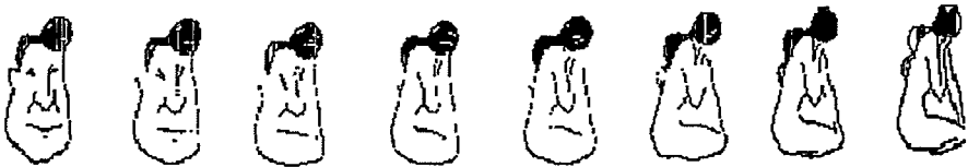
FIGURE 1 51

What people see in the middle drawings depends upon the order in which they examine the series of drawings. People who begin at the right see the middle drawings as a woman's figure; people who begin at the left see the middle drawings as a man's face. Figure 2 presents an even simpler illustration.