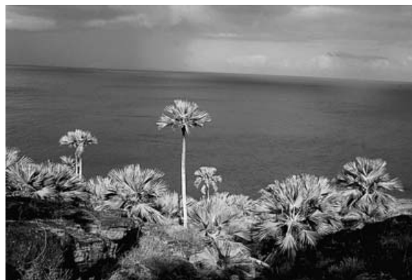
Plate 2 Latania loddigesii woodland on Round Island, Mauritius (M. Maunder).

Endemic to Mauritius and its offshore islands, and widely cultivated on Mauritius and elsewhere, but now restricted to the islands of Gunner's Quoin and Round Island (Plate 2). A Dutch illustration of 1599 shows what appears to be a highly stylized Latania as part of a coastal forest (reproduced in Strickland & Melville, 1848). Johnston (1895) recorded this species from Round Island, Flat Island and Coin de Mire. Regeneration on Round Island increased following the eradication of rabbits and