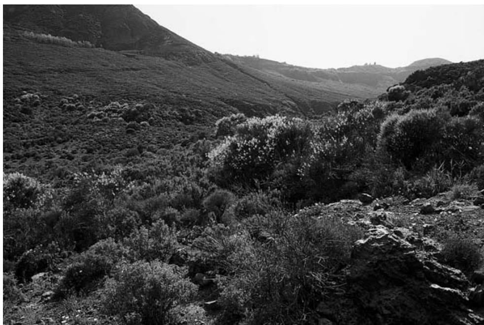
Plate 2 Typical habitat (maquis-type vegetation) of P. raffonei in the Gran Cratere area of Vulcano Island.

P. raffonei is still not regulated by law, and control on remote sites (e.g. the tiny islands) remains difficult.