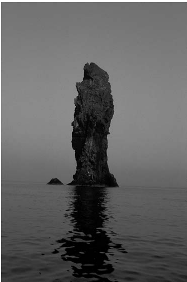
Plate 1 The volcanic rock islet La Canna, 1.5 km west of Filicudi Island.

the number of specimens captured on each island over the ten-year research period are reported in Table 1 and Fig. 2, respectively.