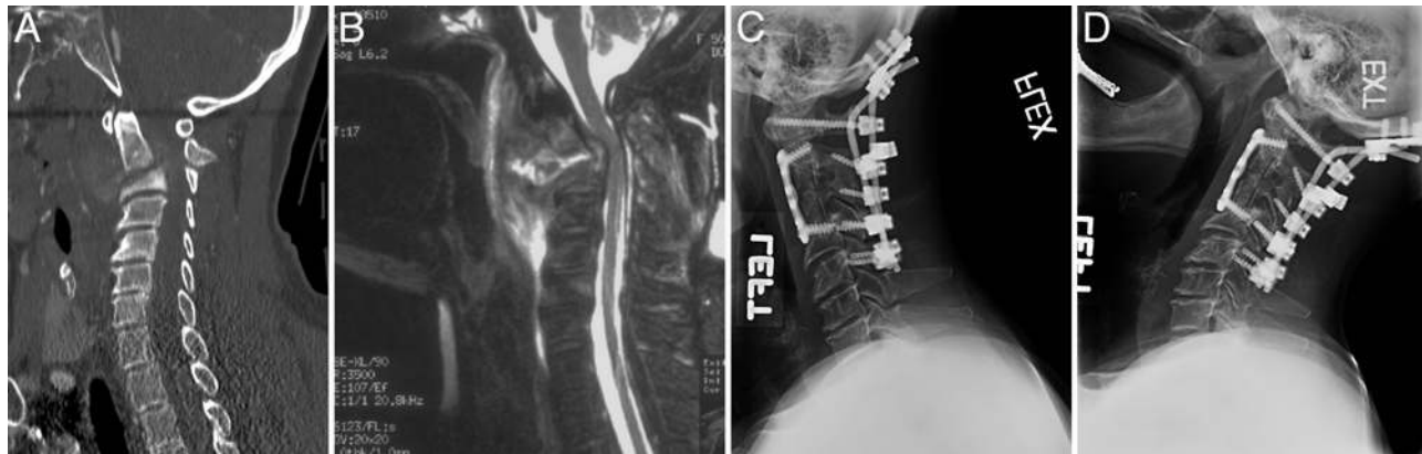
FIG. 3. Illustrative surgical case involving a patient with myelopathy in whom intraoperative neuromonitoring was used. A: Preoperative cervical spine CT sagittal reconstruction demonstrating cervical kyphotic deformity with a high risk for intraoperative neurological deficit. B: Preoperative cervical sagittal T2-weighted MR image demonstrating cervical kyphosis, stenosis, and cord signal change at the C-2 level. C: Flexion lateral cervical spine radiograph obtained after circumferential cervical decompression and stabilization. D: Extension lateral cervical spine radiograph obtained after circumferential cervical decompression and stabilization.