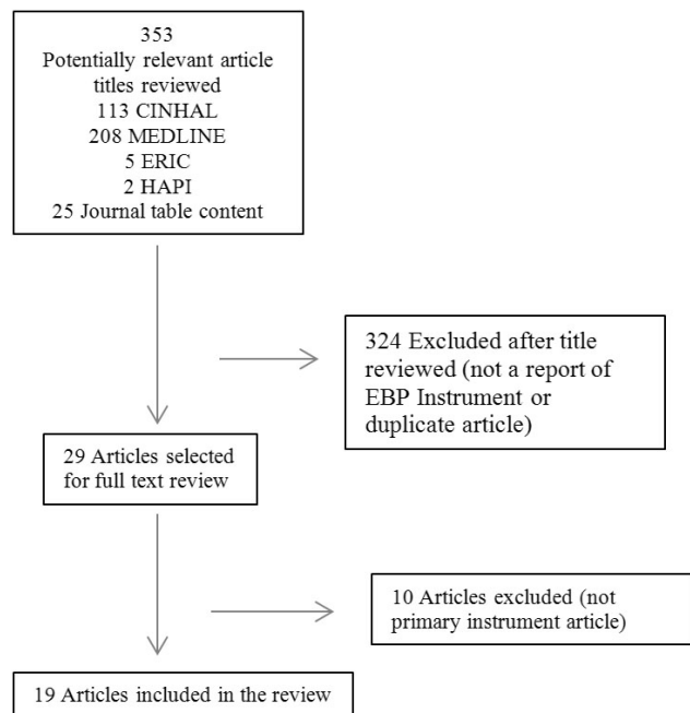
Figure 1. Search for and selection of articles for review

The theoretical domains identified in the articles reviewed included beliefs, barriers, value, readiness to change, knowledge and implementation. For our purposes the concepts of value, knowledge, and implementation were most relevant.