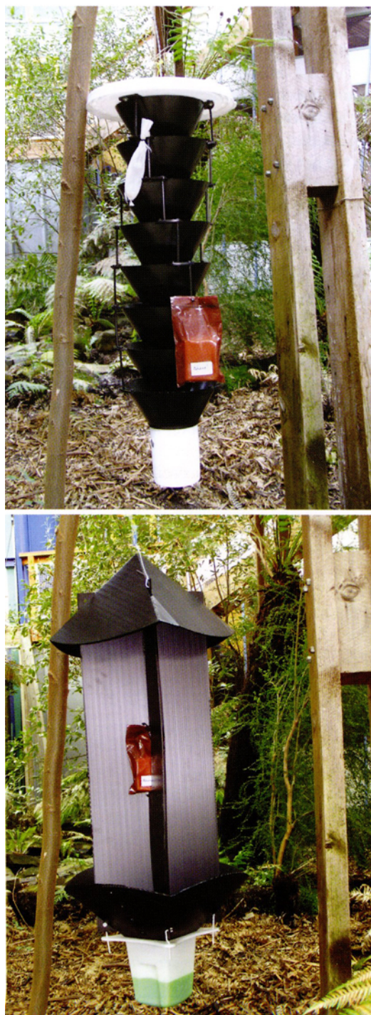
Figure 2. Static trap designs used in plantation monitoring. Top: Lindgren multi-funnel trap. Bottom: Intercept ® panel trap.