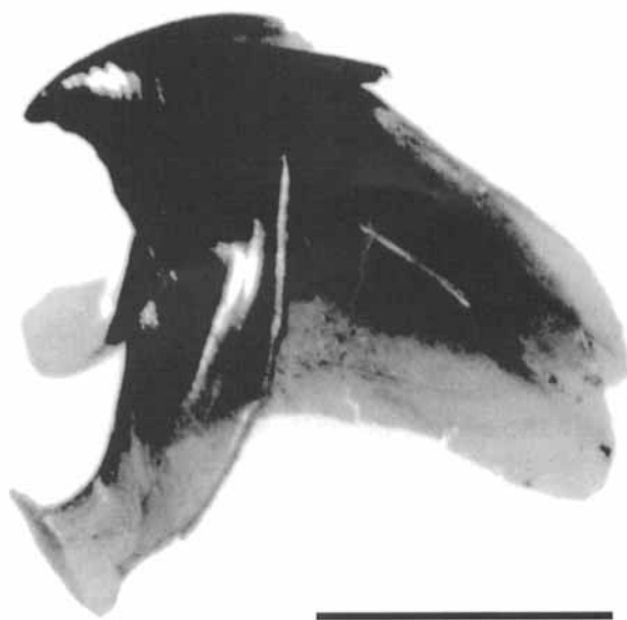
Figure 1. Beak Histiotenthis sp. Scale bar = 10 mm.

out at the Smithsonian Institute, Washington, DC, and by comparison with reference material from M. R. Clarke. In addition, material was sent to N. Voss (University of Miami) and to F. G. Hochberg (Museum of Natural History, Santa Barbara, California) for further confirmation. The lower beak rostral lengths, or lower beak hood lengths of octopods (LRL) were measured to the nearest 0.5 mm using vernier calipers or a graticulated microscope. The wet weight in grams of the cephalopod material was then estimated from LRL beak measurements using regression equations presented in Clarke (1986). Upper beaks were not considered in this paper as they have fewer identifiable features and taxonomic keys are limited.