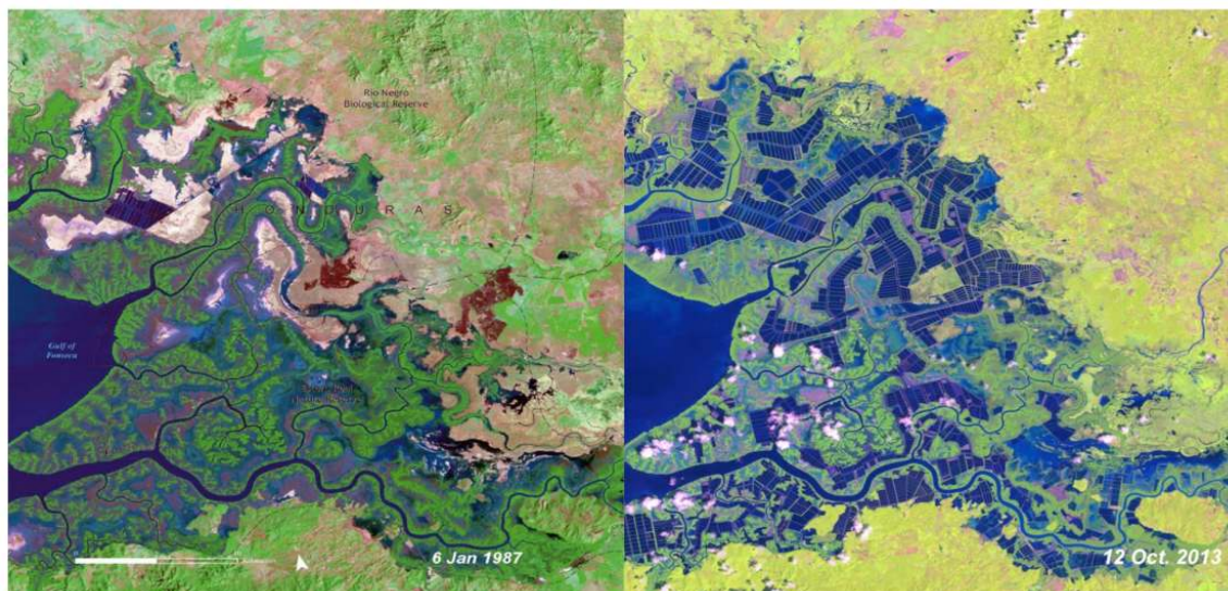
Figure 1. Conversion of mangroves into shrimp farms in Honduras (left extracted from UNEP, 2005; right image analysis by Pascal Peduzzi using Landsat 8 from 2013).

Today, more than 50% of the terrestrial planet has been transformed by human activities [40]. To feed the increasing population and produce more meat, large stretches of forests are being cleared and converted into cropland and pastures [41]. Between 2010 and 2015, 11 million ha of forest were cut down, mostly for conversion to crop land [42]. The largest deforestation occurred in Amazonia, Borneo and the Sumatra islands (Indonesia), and in Africa, as well as in the boreal forests of Canada and Russia. More than half of the world’s mangroves have been cleared, often for conversion to fish/shrimps farms (see the example from Honduras in Figure 1).