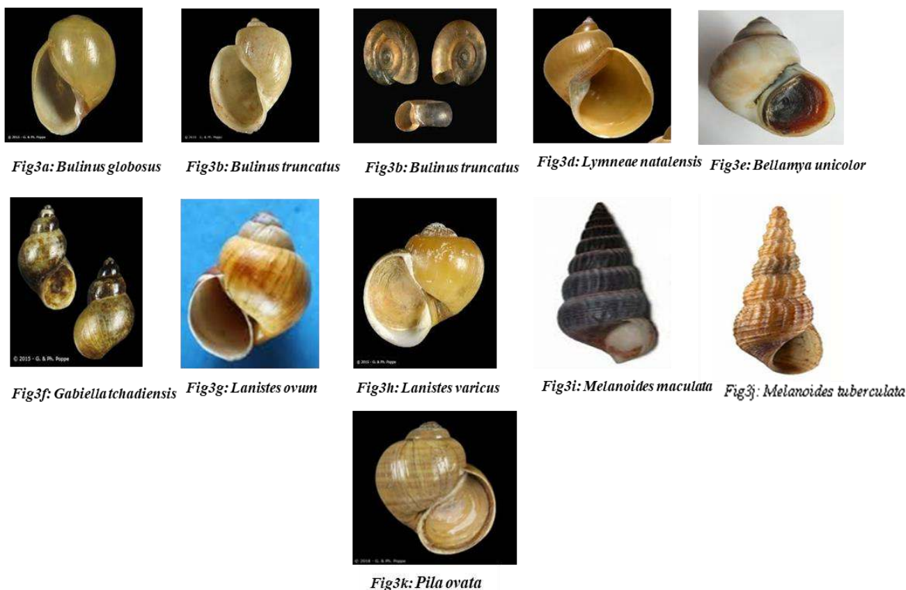
Figure 3 Shell characteristics of the 11 snail species encountered in Kiri Dam