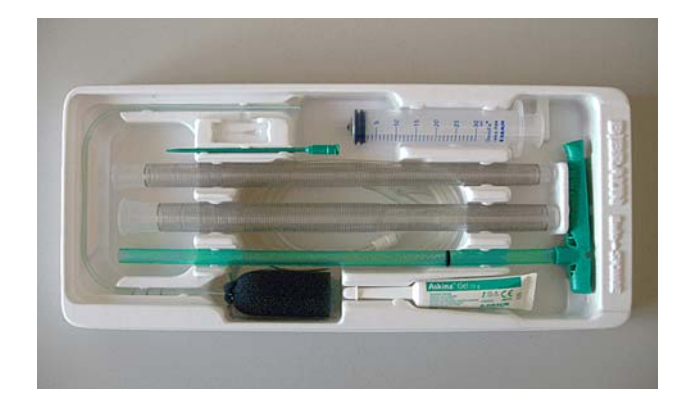
Fig. 1 Endo-sponge