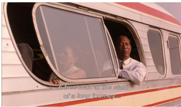
Screenshot 6. An inmate broke loose of prison structure’s grip to start living a new life

The next example of Andy’s agency can be seen after Andy got donations of books and some gramophone records and he played a record in the prison guard’s office. Music in Shawshank prison was never heard, and Andy played the record and put it on the prison loudspeaker. It gave a stunning effect to all inmates as if it were a miracle for them (Screenshot 7), and it drove all the guards and Warden Norton furious. In this example, Andy’s agency undermined the prison structure by doing something that was never done before in it. Furthermore, Andy played the record without asking permission from the guard or Warden Norton (who had power to determine what was accepted or what was not). Indeed, Andy’s agency could make a change in prison, but it was only for a while. Nevertheless, it was not only a fancy change of habit in prison, but it gave such a profound impact to the inmates that Red made the following statement, “And for the briefest of moments, every last man at Shawshank felt free.” However, Andy’s action resulted in his being put in the hole (a stifling cell to give a punishment to disobedient inmates) for two