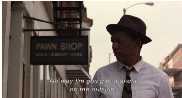
Screenshot 5. Prison structure’s grip on Red after 40 years of being institutionalized

could ever die. Finally, Red made the choice to go and meet Andy, otherwise he would have ended up in prison all his life. In the room where Brooks carved on the wall “Brooks was here”, before committing suicide, Red also carved a similar sentence next to it “so was Red”, making a different choice to keep up living outside prison although the conclusion was unclear to him at that point (Screenshot 6).