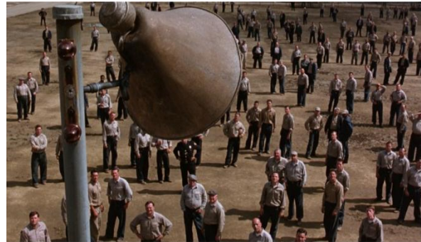
Screenshot 7. The stunning effect of music for the inmates

weeks. This example shows how any effort of violating or undermining structure of domination (no matter how small it is) will result in a sanction, which is severe in Andy’s case.