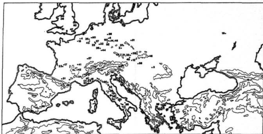
FIGURE 3. Map of sites mentioned in the text.