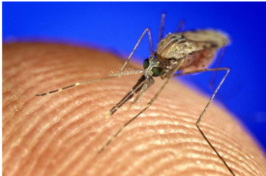
Trends in Ecology & Evolution

Synthetic drive systems have applications far beyond insect population control [92], including agriculture [93], controlling invasive species and pests, or even conservation [92]. We discuss the significant challenges and risks involved in the release of any such drive system in Box 3.