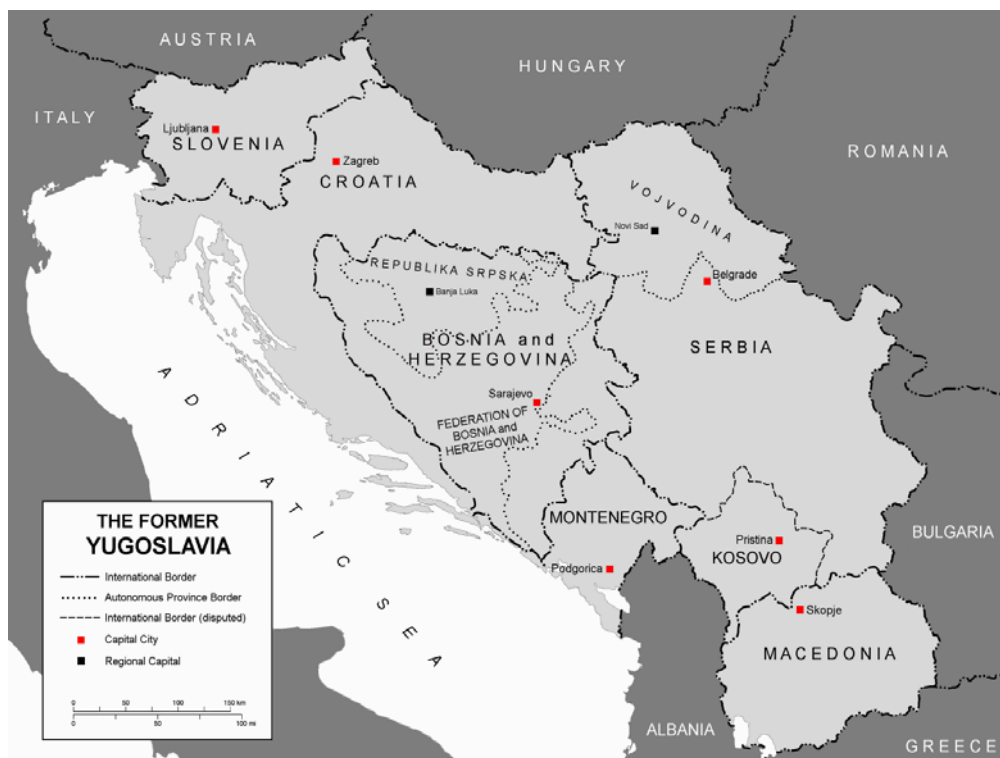
Figure 2. Political map of the former Yugoslavia, 2014.

The country was divided into six constituent republics (Croatia, Bosnia and Herzegovina, 1 Montenegro, Macedonia, Slovenia and Serbia), with the largest republic, Serbia, containing two autonomous provinces, splitting it onto Kosovo, Vojvodina and Serbia Proper (see Figure 2, below).