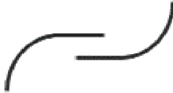
Fig. 2. Schematic of L-type Savonius wind turbine blade

The L-type Savonius rotor wind turbine (Fig. 1) is a development of the rotor model were it dominantly. absorbs the drag force from the wind [15].