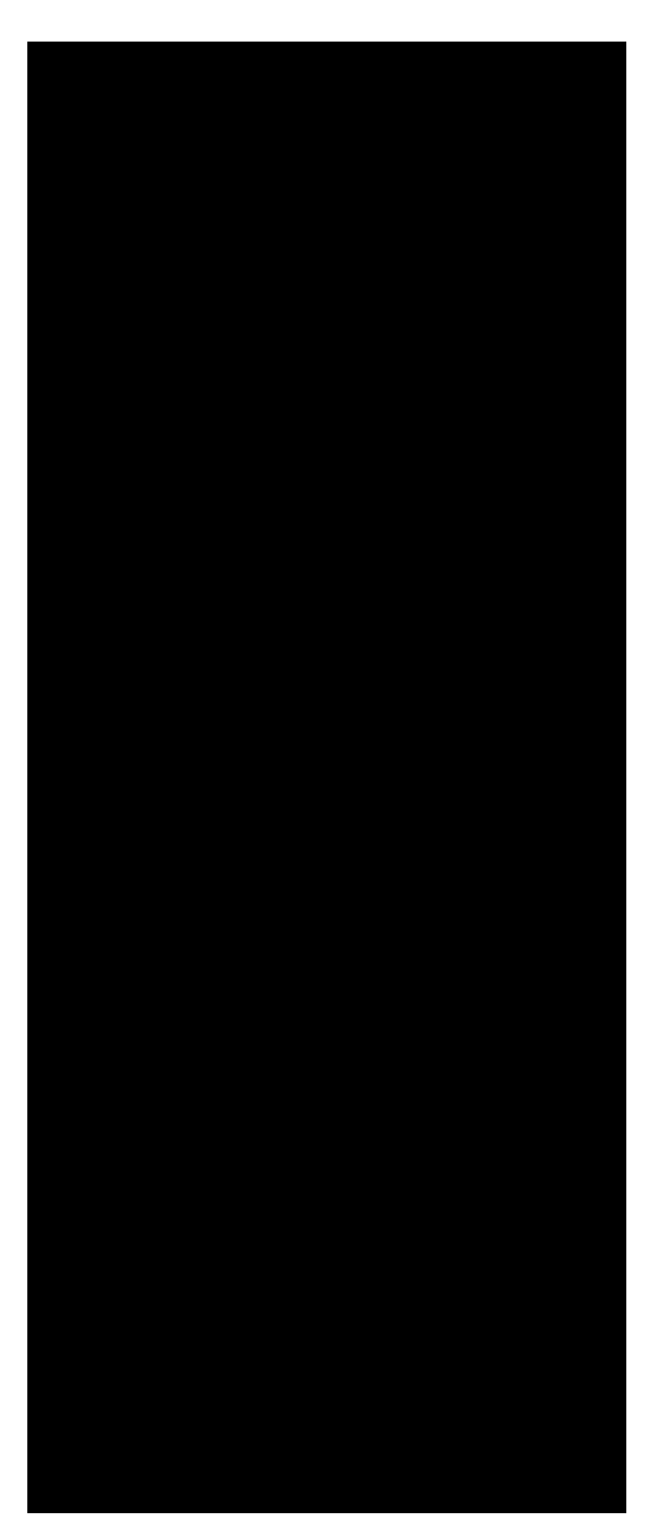
FIGURE 3. Intervention effects on absenteeism.