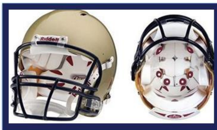
Figure 1: Head Impact Telemetry (HIT) System Helmet Accelerometer Unit. The HIT System helmet unit consists of 6 single-axis accelerometers which are denoted by the red circles seen on the right. The helmet unit records and reports peak linear acceleration of impacts to the helmet to side line computer system.

The HIT System is a side-line reporting system that has the ability to record the frequency, location and magnitude of impacts sustained in football players; the helmet unit consists of 6 single-axis accelerometers and a signal transducer embedded within the helmet (See Figure 1). 41-43 Impacts with a magnitude greater than 10 g are registered on any one of the six accelerometers are recorded then sent to a laptop located on the sideline with a signal receiver. Impacts are recorded for 40 ms. Recorded impacts consist of 12 ms pre-trigger and 23 ms post. 44 Within the helmet unit, there is a data storage device that can store up to 100 impacts in the event the controller loses contact with or is out of range of the signal receiver. Data is presented in 4 different windows on the sideline computer: the first displays a vector with the impact location, the second is an acceleration vs. time graph of impacts, the third displays peak acceleration magnitude history, and the final displays the impact location history. If peak linear impact magnitudes are registered at above 98 g an alert is sent to a clinician on the sideline via a pager.