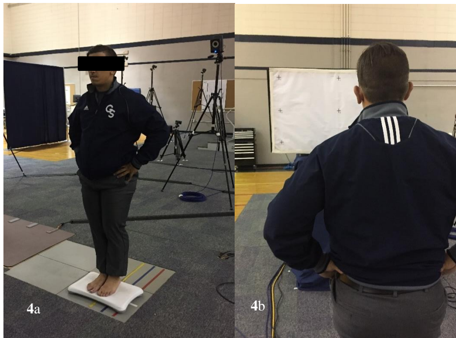
Figure 4: Static postural control assessment. 4a) Position of subject for eyes open and eyes closed condition, 4b) Subject asked to look at point 5 in the middle of the projection screen during the eyes open condition

center of the WBB with their hands in a comfortable and still position. Subjects were told to look at a specific fixed point (point five) on the projection screen in front of them during the eyes open trials, and to remain as still as possible throughout the trial. (See Figure 4a. – 4b.) Each trial of quiet stance lasted 30 s, and each condition was performed 3 times. The tester instructed subjects when to begin quiet stance and when to relax.