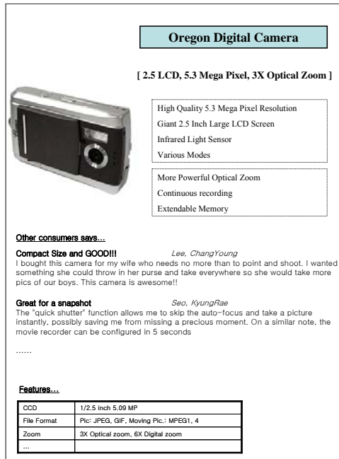
Figure 2. Demo Site for CEA