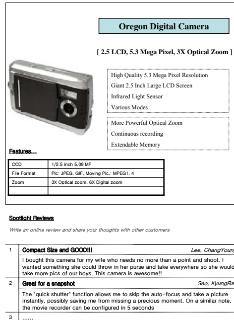
Figure 3. Demo Site for OCR