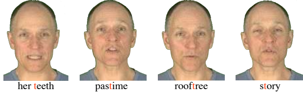
Fig. 1: A selection of movie frames during the articulation of /t/ illustrating the variability of articulator poses due to coarticulation.

visual speech independently of the underlying phoneme labels. Given some training video containing speech, the visible articulators are tracked and parameterized into a low-dimensional space. This parameterization is then automatically segmented by identifying salient points to give a series of short, non-overlapping gestures. These salient points are visually intuitive and fall at locations where the articulators change direction, for example as the lips close during a bilabial, or the peak of the lip opening during a vowel. The speech gestures identified by this segmentation are then clustered to form dynamic viseme groups, such that movements that look very similar appear in the same class. Identifying visual speech units in this way is beneficial as the set of dynamic visemes describes all of the ways in which the visible articulators move during speech. For the remainder of this paper visemes refers to dynamic visemes as defined in [17].