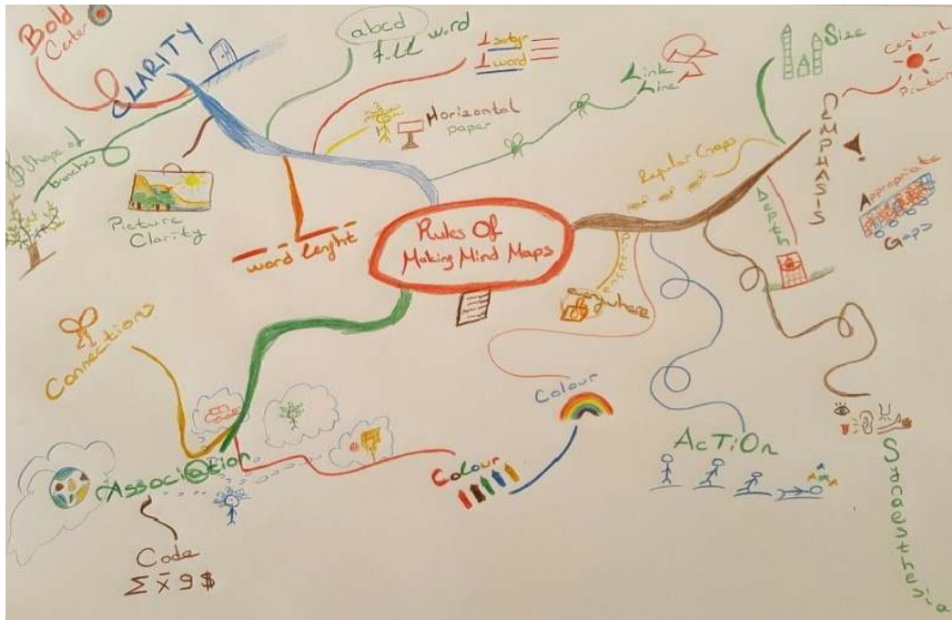
Figure 1. Rules for Making Mind Maps