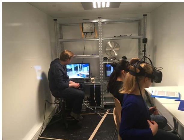
Figure 1. The Thermal test chamber set-up.

During the SenseLab studies the thermal comfort test chamber of the SenseLab was used as a virtual reality experiment to test the thermal comfort of a group of participating school children. In this experiment two primary school children took place behind a school desk per test run, sitting next to each other and wearing VR headsets (see Figure 1). The VR experience took place in a virtual classroom (see Figure 2), that was made in Unreal Engine 4, using two HTC Vive VR headsets.