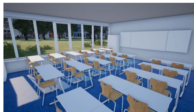
Figure 2. Virtual classroom with blue flooring and white walls.

In order to make a realistic experience the actual school desk and chair were recreated in 3D and placed in the virtual model. By aligning the physical desk with the VR desk, the participants could actually touch and feel the furniture while wearing their VR headset, giving them an increased sense of immersion.