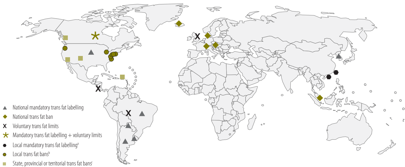
Fig. 1. Trans fat policies around the world, 2005–2012

a Trans fat labelling was mandatory locally in Hong Kong Special Administrative Region and Taiwan, China.