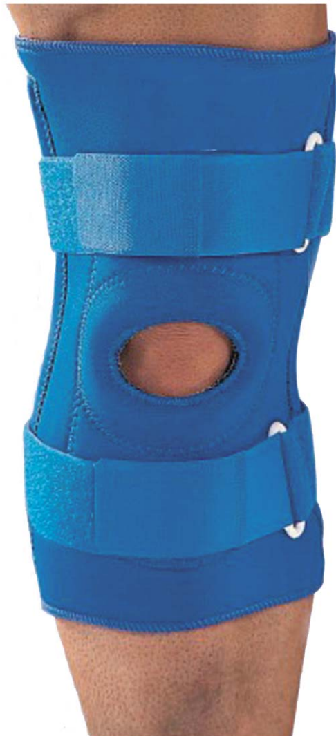
Figure 1. Neoprene knee sleeve with 4 metal supports. doi:10.1371/journal.pone.0050110.g001

Moreover, a prefabricated PKB (fabricated by a certified orthotist) which was designed according to the typical designs in conventional PKBs; the design and manufacture of the PKB was supervised and verified by the faculty members of the department of Orthotics and Prosthetics of Tehran University of Medical Sciences. It included thigh and calf plastic cuffs (Figure 2; A and D), with medial and lateral aluminum uprights (Figure 2; C) and polycentric knee hinges (Figure 2; B). The hinges let full range of