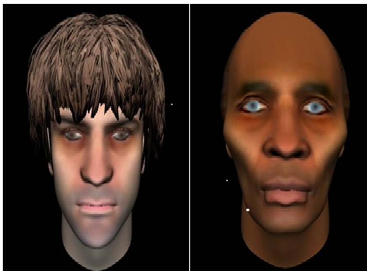
Fig. 2 Examples of avatars

developments within the context of a novel therapeutic milieu. The main goal of this therapy is to facilitate a dialogue between the patient and a computerised representation of their persecutory voice in which the voice hearer is assisted to gain control over the distressing voice. The approach uses computer technology developed by the Speech, Hearing and Phonetics Department at University College London which enables each participant to create a visual representation of the entity (human or non-human) that they believe is talking to them. Additional software is used to transform the voice of the therapist to match closely the pitch and tone of the voice the patient reports hearing, the two processes finally being combined to produce a computer simulation (a virtual agent or 'avatar') through which the therapist can interact with the participant. The therapist promotes a dialogue between the participant and the avatar in which the avatar progressively comes under the participant's control. The sessions are audio-recorded and provided to the participant on an MP3 player for continued use at home [19].