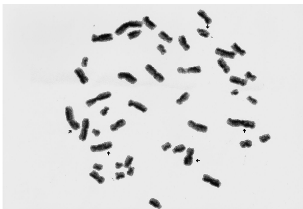
Fig. 1. In the normal state, one of the sister chromatids is stained dark, while the other is stained light. When a reciprocal change occurs, a dark segment and its homologue light counterpart change places leading to alternating dark and light regions throughout the chromatids.

The SCE frequency per metaphase was calculated in all patients and compare within each