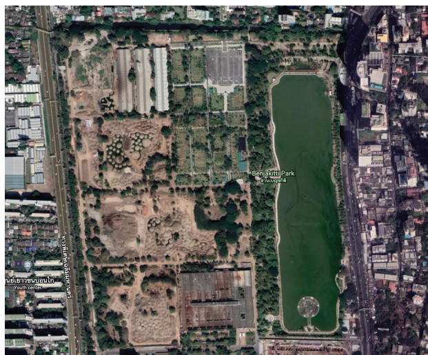
Figure 1. Satellite image of Benjakitti Park

The study was part of an action-research project funded by the Thai Health Promotion Foundation (ThaiHealth) in examining the impacts of minor physical improvements in the public park in Thailand. Benchakitti park was selected for the study because it is one of Bangkok's most prominent and oldest district parks. It can be easily accessed by different modes of public transportations such as bus and underground train and private cars. The park's total area was 130 hectares, with a retention pond for water recreation covered one-third of the area. In 2020, the park area was expanded and are currently undergoing a construction process. Biking and jogging track are surrounding the park, with the west part of the park consist of park facilities such as a playground, fitness equipment, amphitheater, and skateboard park (Figure 1).