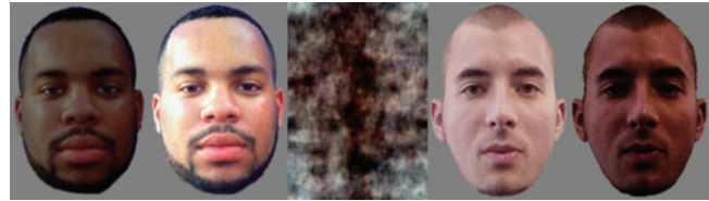
Fig. 1 Example of experimental stimuli presented to participants during the functional scan (i.e. dark-skinned Black face, light-skinned Black face, control image, light-skinned White face, dark-skinned White face).

The experimental stimuli were a subset of five male White faces and five male Black faces identical to those used in Maddox (1998) with neutral expression that varied in skin tone (dark vs light) and matched across conditions using Photoshop 8.0 (Adobe Systems, Inc; Figure 1). Also, to serve as control stimuli, each face was Fourier-transformed into a scrambled image with the same amplitude but random phase spectrum. Stimuli were presented using MATLAB and projected onto a high-resolution screen at the base