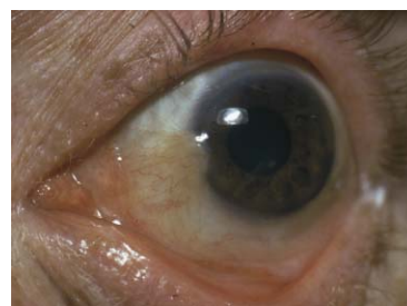
Fig. 2 An early pterygium.