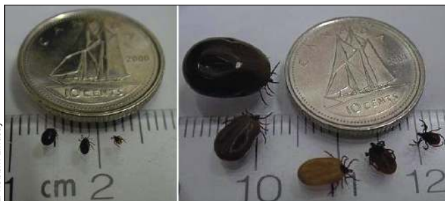
Figure 1: The life stages of the blacklegged tick, Ixodes scapularis , which transmits Lyme disease. Nymphs (left-hand photograph) and adult females (right-hand photograph) are shown in various stages of engorgement from unfed (at the right of each picture) to fully engorged (at the left of each picture). The western blacklegged tick, Ixodes pacificus , is morphologically very similar to I. scapularis .

Within several weeks after the tick bite and manifestation of the erythema migrans lesion, the lesion disappears and the bacterium disseminates hematogenously to other tissues, including additional skin sites (producing secondary erythema migrans lesions in some cases), the nervous system, the heart and the joints. 3 Bacterial culture or use of polymerase chain reaction to amplify target sequences in clinical material (such as blood, skin, synovial fluid or cerebrospinal fluid) are diagnostic methods with low to moderate sensitivity. 2,5 Public health laboratories in Canada, 6,7 the United States 2,8 and some European countries advocate a two-tiered serologic testing process, consisting of enzyme-linked immunosorbent assay followed by Western blot, to assist in diagnosis. Serologic testing is insensitive in very early Lyme disease, but the 2-tiered method is much more sensitive in detecting cases of disseminated Lyme disease. 2,5,7,9 When used alone, enzyme-linked immunosorbent assay has limited specificity, but the