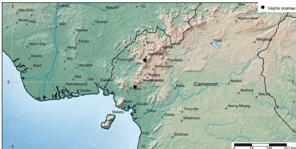
Map 1. Global distribution of Vepris onanae

HABITAT. Lower submontane forest with Pterygota mildbraedii Engl. as emergent trees from canopy (North West Region only). Associated species of tree are Allanblackia gabonensis (Pellegr.) Bamps (Clusiaceae), Alsophila spp. (Cyatheaceae), Noronhia africana (Knobl.) Hong-Wa & Besnard ( Chionanthus africanus (Knobl.) Stearn) (Oleaceae), Macaranga occidentalis (Müll.Arg.) Müll.Arg. (Euphorbiaceae), Polyscias fulva (Hiern) Harms (Araliaceae), Pseudagrostistachys africana (Müll.Arg.) Pax & K.Hoffm. (Euphorbiaceae), Santiria trimera (Oliv.) Aubrév. (Burseraceae), Trichilia dregeana Sond. (Meliaceae) (Harvey et al. 2004:17 – 18) alt. 1310 – 1600 m.