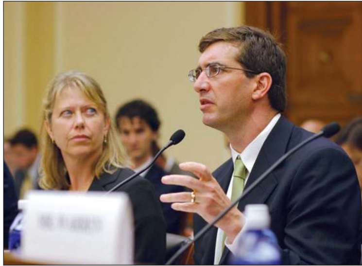
Figure 1. Scott Doney from the Woods Hole Oceanographic Institution (Woods Hole, MA) and an Aldo Leopold Leadership Program Fellow testifying before the US Congress.

University and college teachers are well aware that students are increasingly approaching environmental sci-