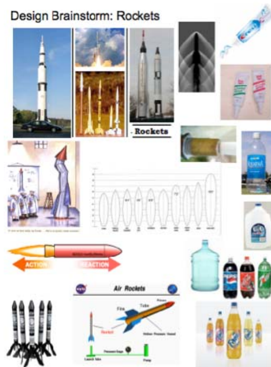
Figure 2: Visuals to assist in brainstorm activity

Visual cues can assist in student team discussions and engage them in active brainstorming. Several brainstorming techniques such as mind mapping and brainwriting were used. Once students completed the brainstorming session, they were then asked to draft a sketch of three rocket prototypes. These sketches needed to include proper dimensions, materials, and scaling. Engineering drawing concepts were introduced in order to guide the students in the drafting process. The students were also asked to include what materials would be used and to identify the purpose of each component of the design. This was done to encourage the students to use purposeful design techniques and to consider the function of each component. The components could be identified as a form factor or a functional factor, but that had to be decided by the team of students.