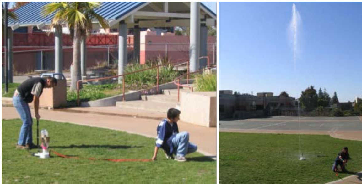
Figure 5: Images of rocket launching