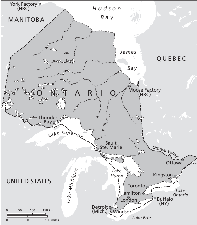
Map 3 Ontario