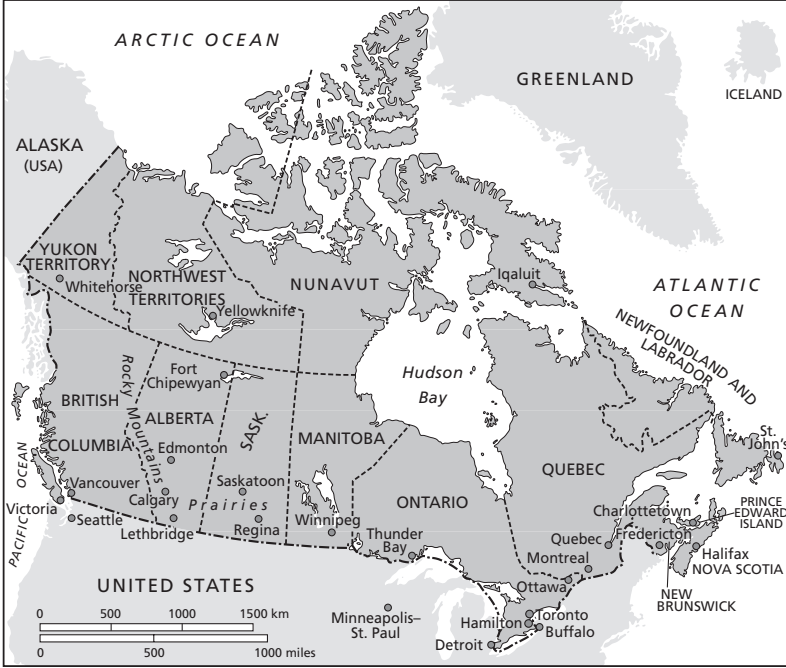
Map 1 Canada