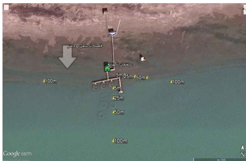
Figure 1. Location of the sampling stations on the Gorgan Bay (Google Earth)