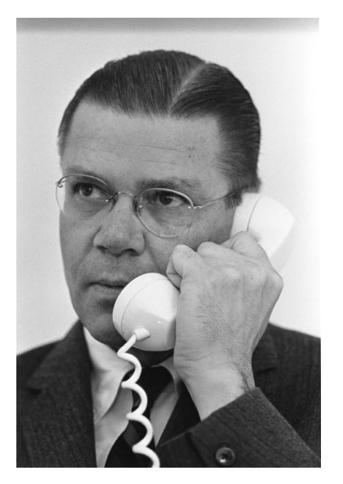
Robert S. McNamara

McNamara bring a modicum of coherence and integration to the overall administration of the Defense Department in the 1960s. The price, however, was a ruthless, relentless bureaucratic struggle that not only contributed to the disaster of Vietnam but left a legacy of suspicion and deceit that infects American civil-military relations to this day.<sup>50</sup> (Even today, embittered officers identify their nemesis by his full name—Robert Strange McNamara—to express their loath-