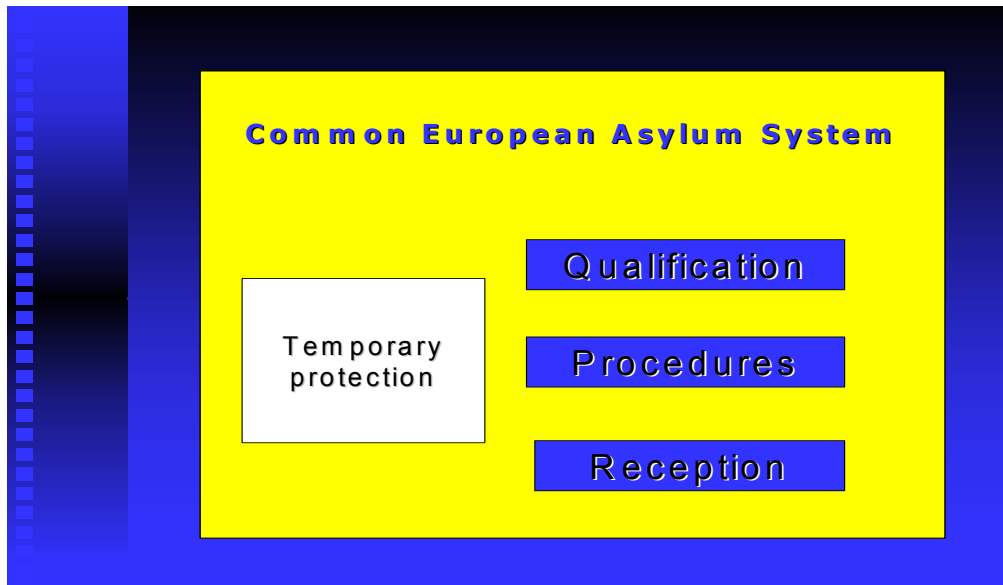
Figure 1: The current Institutional organization of issues within Justice and Home Affairs.

This is essentially the administrative and legal agenda of the EU, with no regard for the broader philosophical discussions of the last five years.