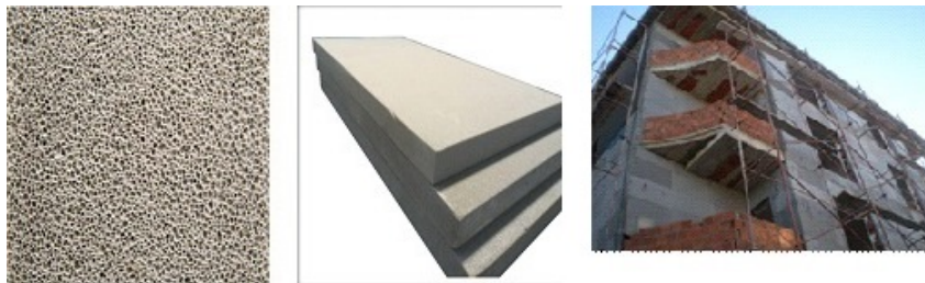
Fig. 8. Building components with wasted ceramic contained and its application.

Aero gels: Aero gels which are today’s advanced technological products are used in construction sector as heat and fire insulation material. Components in Aerogel are silicon based solid agents in which the liquid component of the gel is replaced with air. The surface of aero gels consisting of millions of small holes is similar to a sponge: 99,8% of it is occupied by air and it is a very good insulation. Since they have a translucent nature, they are called “freeze smoke” or “solid smoke”. When compared with glass which is another silica based agent, aero gels have 1000 times less density and a porous structure. The holes whose magnitude is about one/billionth of millimeter occupy the inside of material like a net. The surrounding of the holes is covered by a different material [51].