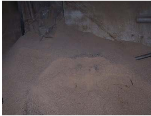
(b) Shavings that come after the cut of wood and is used in furnaces as fuel