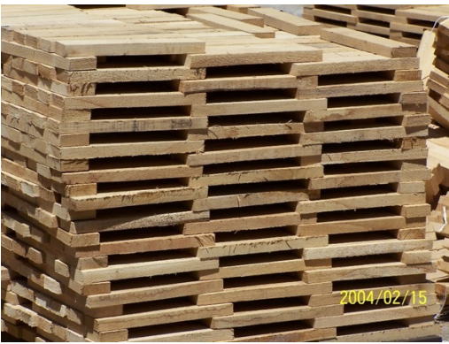
(c) Drying the cut wood in the open air