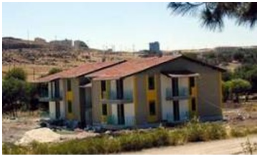
Fig. 3. Alker Building, four apartments on 2 stories at Urfa, Turkey [38].

it may have a content of silica at about 75% rate. Pumice can be used in all fields where perlite is used [40]. Like perlite, does not require energy to expand, which affects its energy efficiency positively.