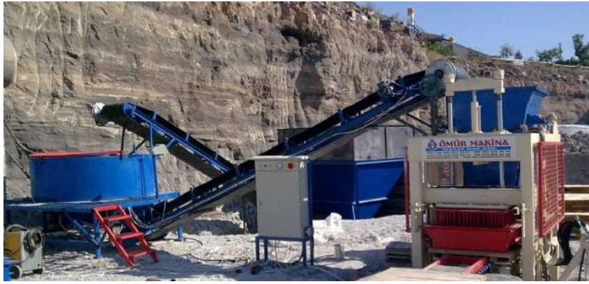
Fig. 4. Manufacture of pumice block with pumice block production machine in pumice resource [43].