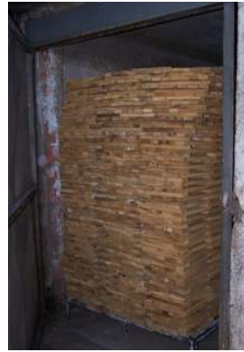
(d) Drying the wood in furnace to decrease the humid level of the wood dried in the open air