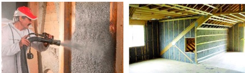
Fig. 7. Application of boron added cellulosic insulation material [50].