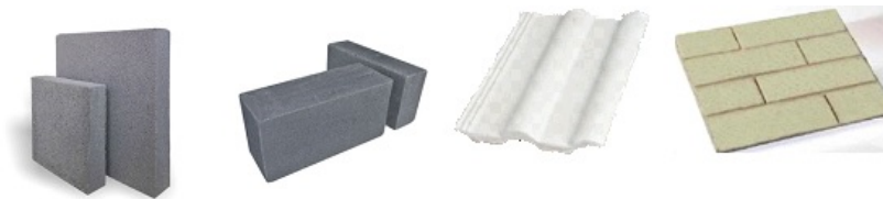
Fig. 6. Building components with perlite contained.