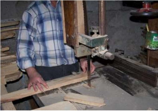
(a) Processing wood with electrical machines