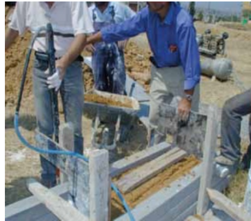
Fig. 2. Preparation of adobe block with gypsum [38].