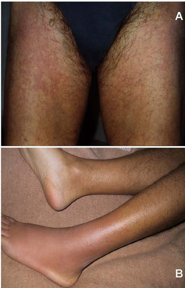
Fig. 3 Centrifugal migratory erythematous skin lesions characteristic of febrile flares occurring in the autosomal dominant familial periodic fever (a) and a typical short-lived erysipelas-like rash during a febrile attack of familial Mediterranean fever (b)

AIDs worldwide is familial Mediterranean fever (FMF), a recessively inherited disease characterized by episodic fevers with some combination of self-limited sterile peritonitis, pleurisy, transient arthritis of large joints or a characteristic short-lived ankle rash (Fig. 3). The FMF-involved gene is MEFV , which encodes pyrin (also named TRIM20 or marenosttrin), a cytoplasmic and nuclear protein also involved in the pathogenesis of MKD and other inflammasomopathies, which can sense pathogen-induced modifications of host Rho GTPases. In particular, pyrin recognizes Rho-modifying bacterial toxins which inactivate RhoA GTPase and dephosphorylate pyrin: GTPase-mediated pyrin phosphorylation inhibits IL-1 production, while mutant pyrins cannot be phosphorylated and activate the pyrin inflammasome, increasing both production and release of IL-1 [31]. Carriers of MEFV mutations are particularly concentrated in the areas of the Mediterranean basin [32], though the highest prevalence of healthy carriers