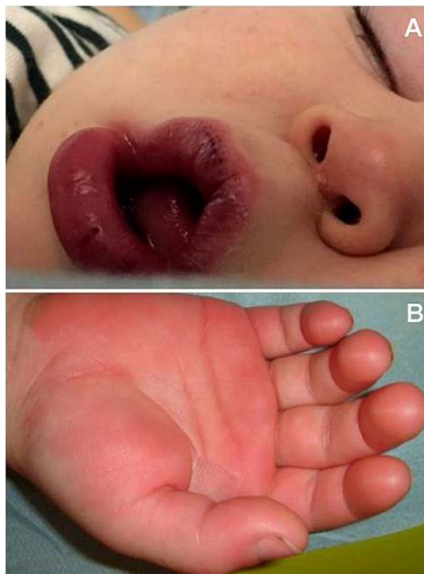
Fig. 5 A typical mouth with swollen lips/vertical cracking a and a hand with palm erythema/indurative edema b in a child diagnosed with Kawasaki disease

after a variable number of years [69]. The syndrome is largely observed in children less than 6 years showing recurring fevers every 3–6 weeks combined with at least one among aphthous stomatitis, pharyngitis and/or cervical lymph node enlargement with no evidence of upper airways infections [70]. There are limited studies focusing on the infradian cycle of PFAPA symptom recurrence, though clock-related genes and their relationship with immunity have been recognized [71]. Diagnosis of PFAPA syndrome in a pediatric scenery requires laboratory evaluations both during and between febrile episodes, detailed history-taking and mindful collection of all physical findings to exclude primary immunodeficiency disorders or hereditary AIDs. This is important as low-dose corticosteroids can brilliantly relieve most PFAPA symptoms presented by children, while colchicine may add some help in those patients carrying heterozygous MEFV gene mutations [72]. An IL-1-mediated pathogenesis suggests the autoinflammatory origin of PFAPA syndrome, which appears as a rhythmic self-limited