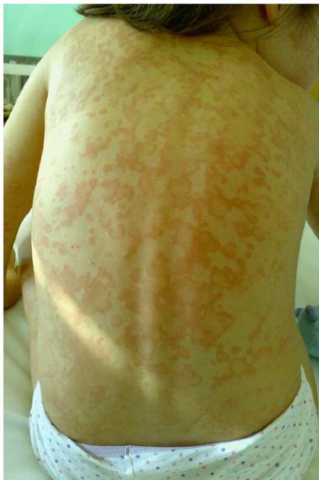
Fig. 4 A typical short-lived evanescent nonfixed evanescent salmon-pink rash that appears with fever peaks and fades away when the fever subsides in a child with systemic juvenile idiopathic arthritis

after a variable number of years [69]. The syndrome is largely observed in children less than 6 years showing recurring fevers every 3–6 weeks combined with at least one among aphthous stomatitis, pharyngitis and/or cervical lymph node enlargement with no evidence of upper airways infections [70]. There are limited studies focusing on the infradian cycle of PFAPA symptom recurrence, though clock-related genes and their relationship with immunity have been recognized [71]. Diagnosis of PFAPA syndrome in a pediatric scenery requires laboratory evaluations both during and between febrile episodes, detailed history-taking and mindful collection of all physical findings to exclude primary immunodeficiency disorders or hereditary AIDs. This is important as low-dose corticosteroids can brilliantly relieve most PFAPA symptoms presented by children, while colchicine may add some help in those patients carrying heterozygous MEFV gene mutations [72]. An IL-1-mediated pathogenesis suggests the autoinflammatory origin of PFAPA syndrome, which appears as a rhythmic self-limited