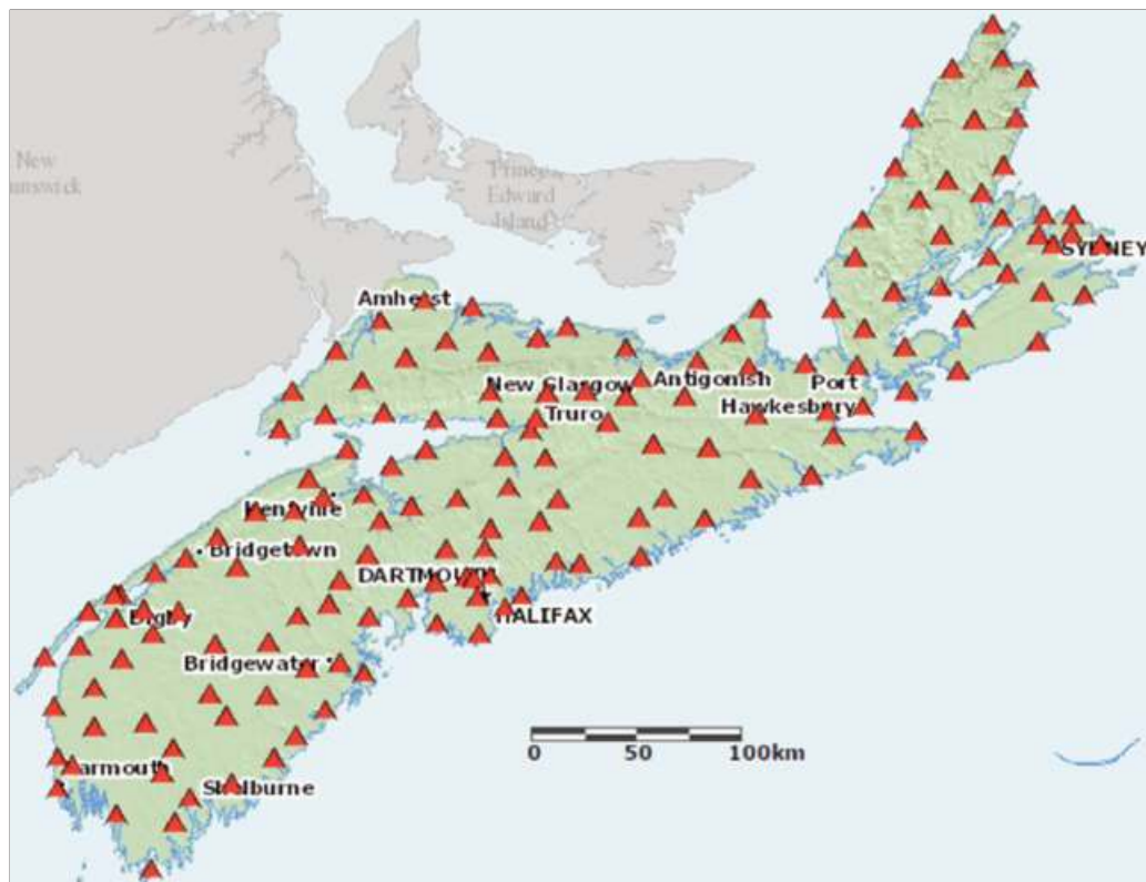
Figure 2: NSHPN reference framework.