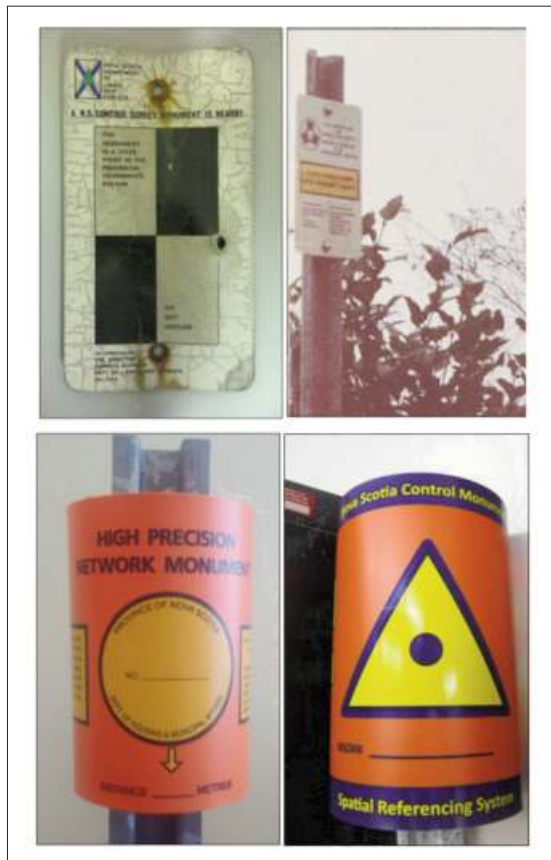
Figure 4: Evolution of the Nova Scotia Control Monument Sign from 1968 to 2015. Top left—circa 1968; top right—circa 1979; bottom left—circa 1996; bottom right—2015.