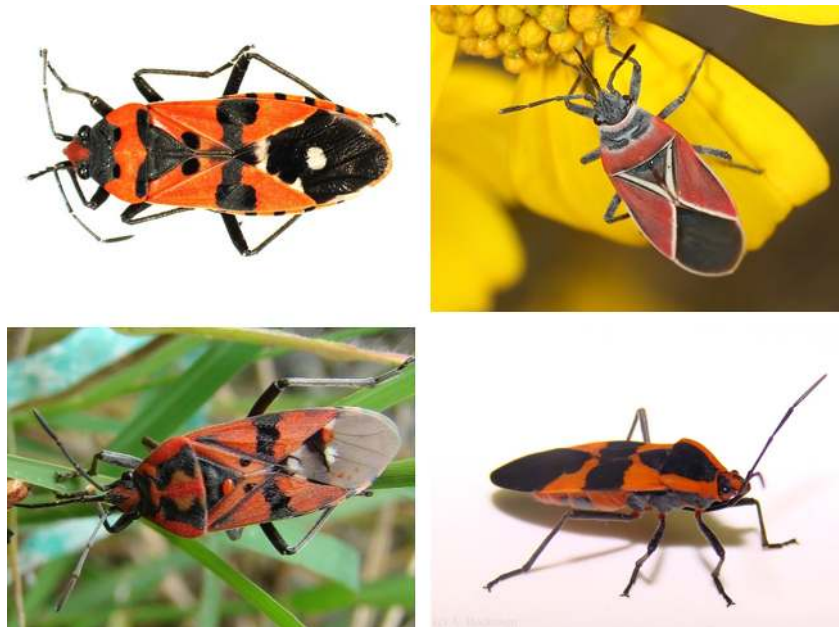
Figure 3. Four extensively studied species of Lygaeidae. Top right Neacoryphus bicrucis, bottom right Oncopeltus fasciatus, bottom left Spilostethus pandurus and top left Lygaeus equestris.