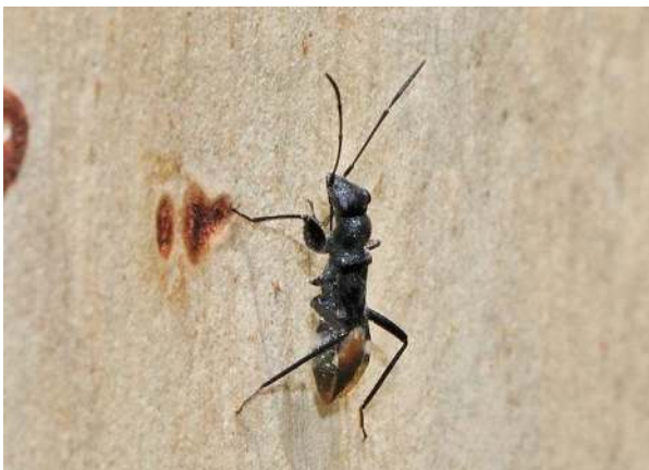
Figure 5. An ant-mimicking Seed Bug - Daerlac nigricans – from the Family Rhyparochromidae.

In terms of interspecific interactions, one particularly fascinating interaction concerns ant mimicry or “myrmecomorphy” (McIver and Stonedahl 1993), which is widespread in the Lygaeoidea and appears to have evolved multiple times (Schuh and Slater 1995). This mimicry is thought to act as an anti-predator defence as many predators avoid ants (Durkee et al. 2011) and may be morphological (Fig. 5) or behavioral in nature. For example, Neopamera bilobata , a Neotropical lygaeid, moves with jerky, ant-like movements when disturbed. This has been described as “action mimicry” and is thought to cause predators to hesitate in their attack, allowing the bugs