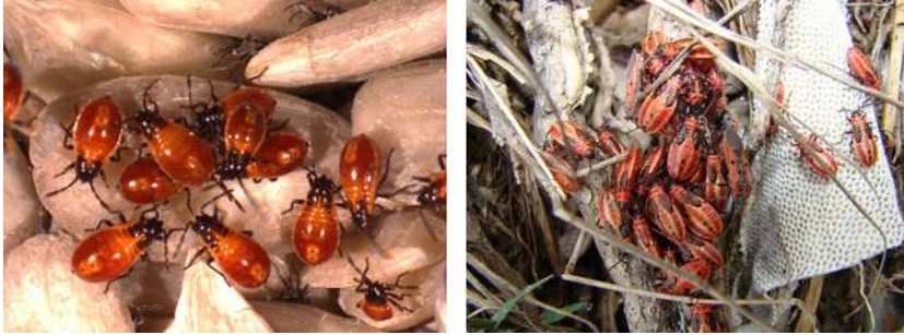
Figure 4. Right – Laboratory raised second instar nymphs of the species Spilostethus pandurus showing characteristic black and red coloration. Left – an aggregation of late-instar Lygaeus creticus nymphs and adults. Sicily.

Oncopeltus genus have been observed in aggregations containing both adults and nymphs (Root and Chaplin 1976). We will also discuss aggregation in the Lygaeidae further below when we consider the importance of pheromones. While groups are often considered to comprise kin, the extent of nonkin aggregations has yet to be investigated. As mentioned above, in some temperate species adults also aggregate for hibernation. This has been most extensively studied in the species Lygaeus equestris where hibernating adults typically enter reproductive diapause before aggregating at overwintering sites.