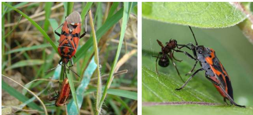
Figure 2. Left - An adult Spilostethus pandurus feeding on a Lygaeus creticus nymph. Sicily. Right - A Lygaeus kalmii feeding on an ant.

Third, four species of Nysius ( Nysius plebeius , N. expressus , and two species not identified to species level) have been found to harbor the primary gamma-protobacterial endosymbiont Schneideria nysicola in a pair of bacteriome structures (Matsuura et al. 2012). These authors also identified Wolbachia and a novel alpha-proteobacterium in these species, finding the latter in five other species