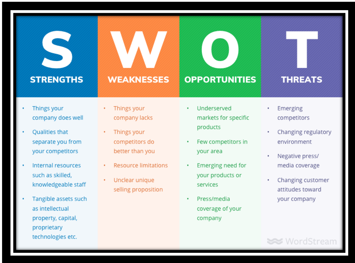
Figure 2. Elements of SWOT analysis. (Shewan, 2019)

The SWOT methodology involves first identifying strengths, weaknesses, opportunities, and threats, and then establishing links between them that can be used to formulate an organization's strategy (Nyemtsov VD & Dovhan L. YE., 2002) (Table 2).