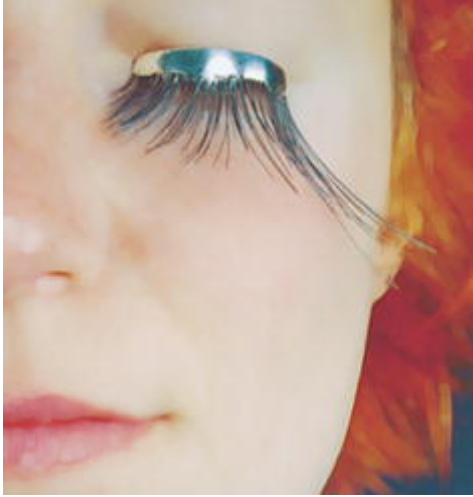
Fig. 2 'Eyelashes' 1999. Jayne Wallace

that masks a sense. A playfulness like the playful masking of the sense of sight to minimise distraction and create a rich space for concentrating on the self. The pieces were designed to counter the idea or experience of fear related to masking a sense by presenting masking pieces that were visually beautiful and comfortable—indicating choice rather than enforcement in wearing the forms.